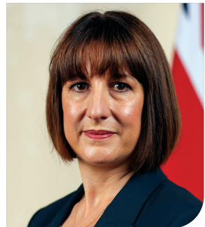
Official portrait of Rachel Reeves MP

Other significant tax increases included higher capital gains tax rates and a future reduction in inheritance tax business and agricultural reliefs. Despite the additional revenue, the Office for Budget Responsibility (OBR) projects that increased spending will mean that borrowing will still be over £70 billion in 2029/30. Not without reason does the OBR say, “...this Budget delivers a large, sustained increase in spending, taxation, and borrowing”.